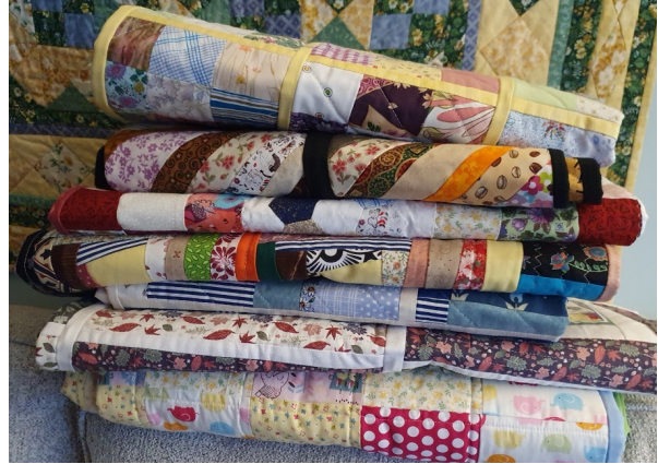
Pile of quilts made by a York quilter, delivered with other quilts and blankets to the local refuge

During lockdown many of our volunteers have taken the opportunity to make us wonderful quilts. We are grateful for all quilts we receive, for our Area Co-ordinators have multiple outlets for the quilts. Hospitals will only take a certain number of quilts for premature babies so, if you are unsure which size to make please check with your Area Co-ordinator. The Directors, Project Linus UK