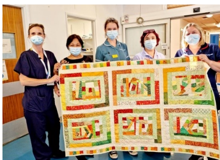
Staff at the Medical Haematology Day Unit with some Linus Quilts for their young day patients

Our second new charity is the Hillingdon Hospital Charity which accepted some quilts for the Medical Haematology Day Unit patients. In their words 'such a beautiful gift for children and young people needing a quilt 'hug' during day treatments and something lovely for them to take home.'