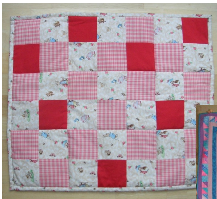
Photos of her first three Linus quilts